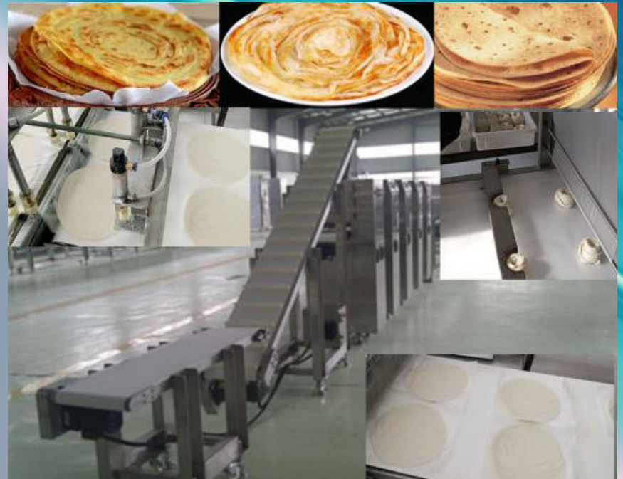
Automatic Whole Lacha Pratha Production Line